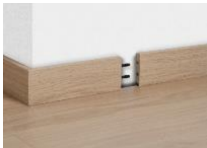
Connection of 2 skirting boards along the wall